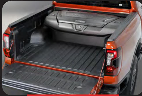
Maxbox Storage System