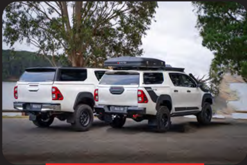
Available in two colour options