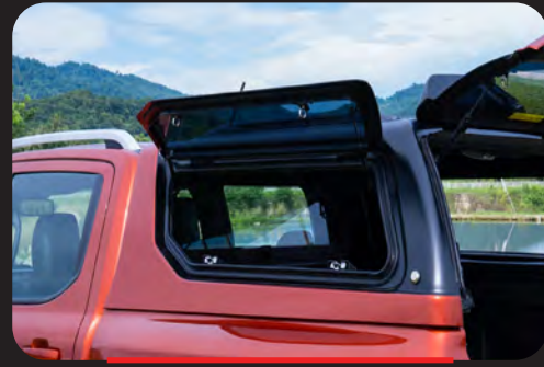
Handle free large side window for easy access