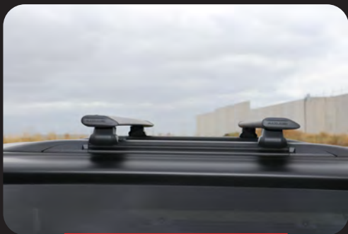
Optional Maxliner cross bars