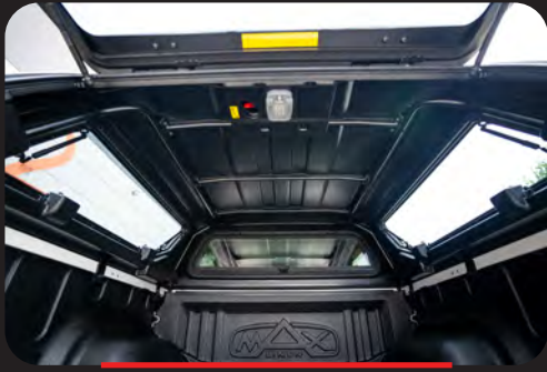
Internal steel structure for increased roof carry capacity*