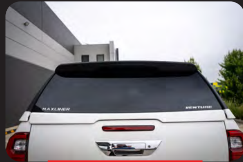
Rear spoiler & colour coded lower glass accent panel