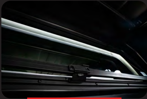
Front lift-up window with optional ventilation