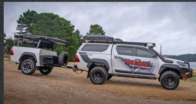
Rhino Rack www.rhinorack.com.au