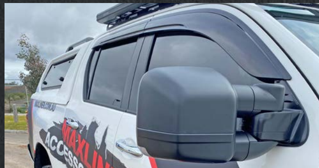
Clearview Accessories www.clearviewaccessories.com.au