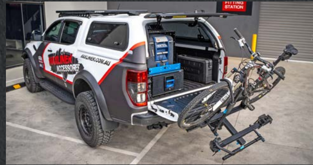
Rocky Mounts Bike Carriers