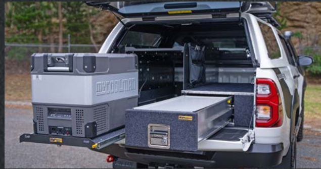
RV Storage Solutions www.rvss.com.au