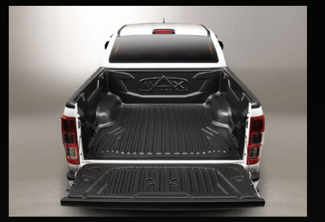
Easy to clean from dust, mud, and chemical residues • Available in over rail or under rail sets • 100% anti UV protection

Designed to meet the highest specifications of each vehicle where toughness, agility and dependability are all combined into the Maxliner brand. Our products are also tested under the most servere and harsh environments which makes it the strongest bed liner ever manufactured.